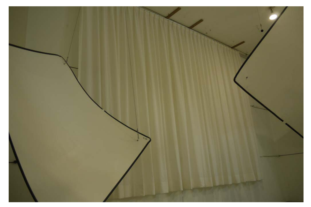
Figure B.3. Test object mounted in the reverberation room.

Curtain fabric Colorama 2, folded arrangement with 100 % addition, Manufacturer Silent Gliss