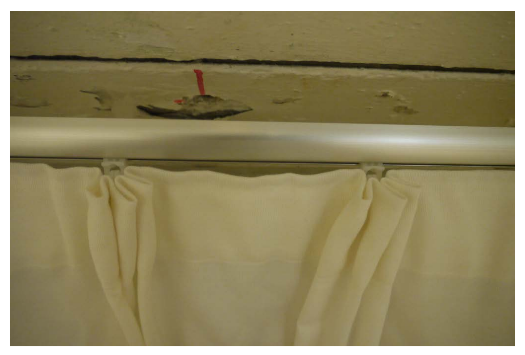
Figure B.1. Curtain track system rail with curtain fabric in folded arrangement.

Curtain fabric Colorama 2, folded arrangement with 100 % addition, Manufacturer Silent Gliss