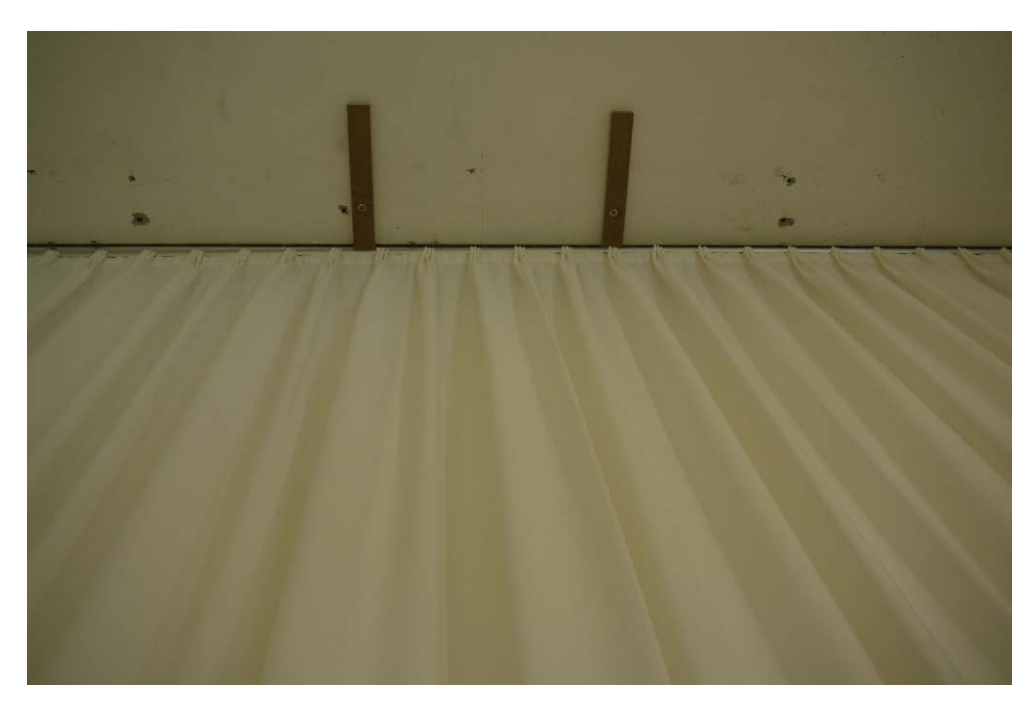
Figure B.2. Test object mounted in the reverberation room.